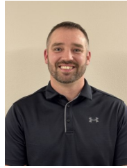
Mayor Chris Whitehead

The City Council meets on the 1 st and 3 rd Tuesdays of each month at City Hall—1205 6th Ave. S. at 5:30 p.m. Council meetings are broadcasted live on the city's YouTube channel.